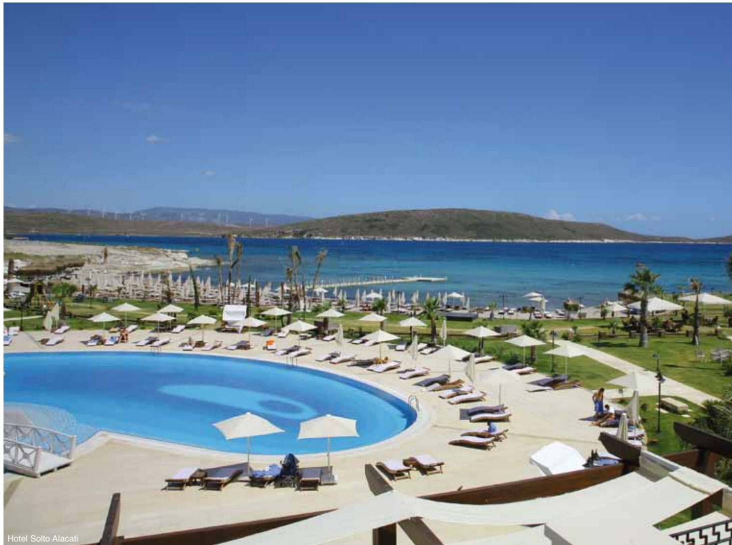
Hotel Solto Alacati

1 week DBL/BB incl. flights & transfers from 595 EUR per person