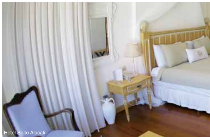
Hotel Solto Alacati